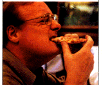
Reid Duffy INDIANAPOLIS dine Contributing Writer